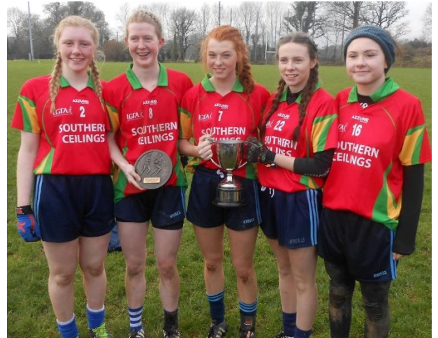
SCOIL MHUIRE (CARRICK-ON-SUIR) ALL-IRELAND & MUNSTER SENIOR POST PRIMARY CHAMPIONS