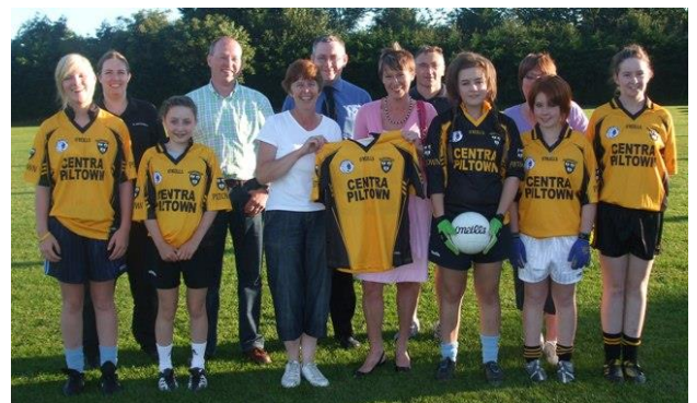
HICKSONS CENTRA Sponsor a Set of Jerseys