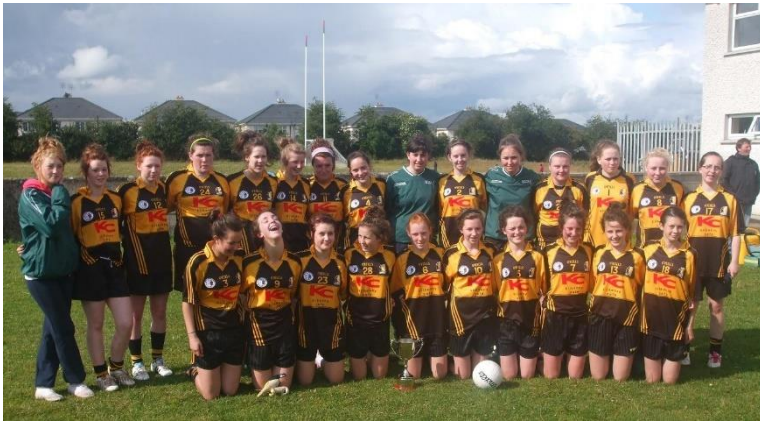
Leinster Under-16 Roinn C Final Kilkenny beat Offaly 4-7 to 3-4 in Graiguecullen