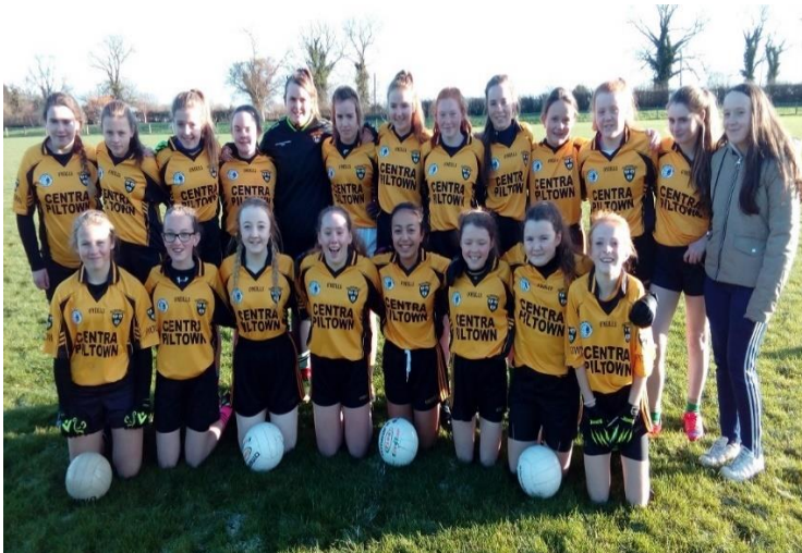
Under-14 Shield Finalists