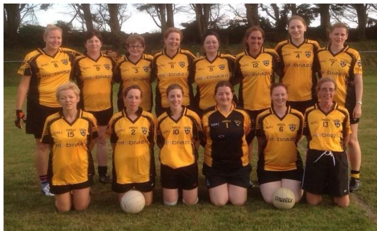
Gaelic4Mothers & Others versus Dunhill (Waterford)