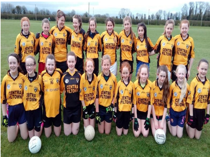
Under-14 Féile Squad