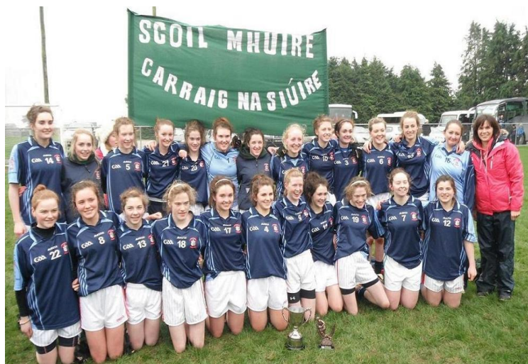
MUNSTER SENIOR "C" CHAMPIONS