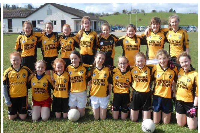
UNDER-14 FEILE TEAM