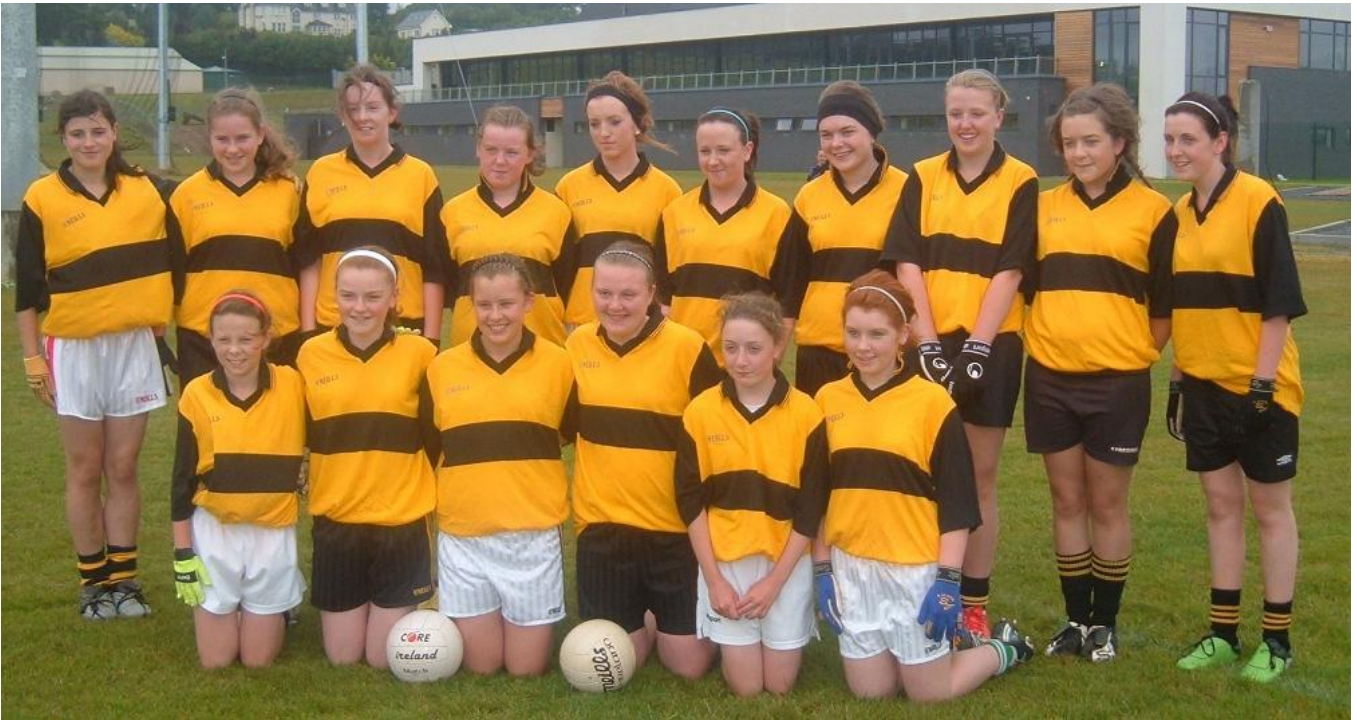
Piltown Ladies Gaelic Football squad that achieved the Piltown Club's historic first win when they beat Roanmore (Waterford) 2-1 to 2-0 at W.I.T. grounds in Carriganore