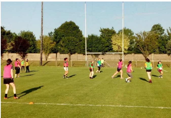
Left GIVE-IT-A-GO Night