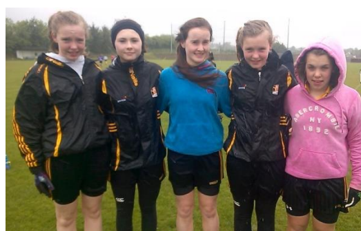
Leinster Division 2C Shield Medal winners with Kilkenny