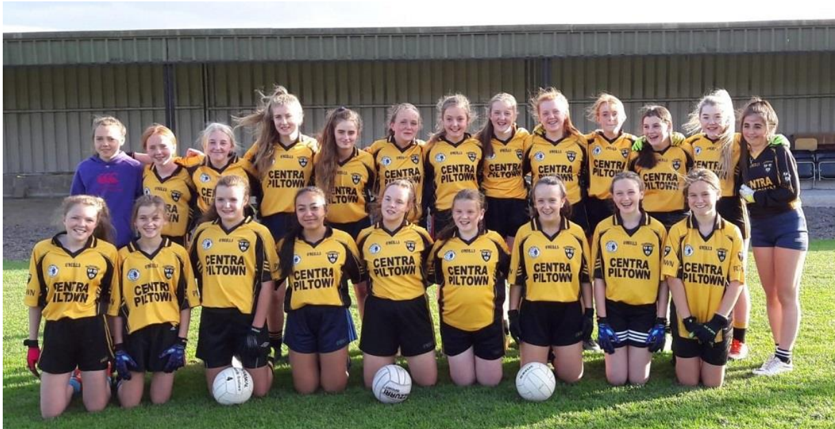
Under-14 League Final v Thomastown