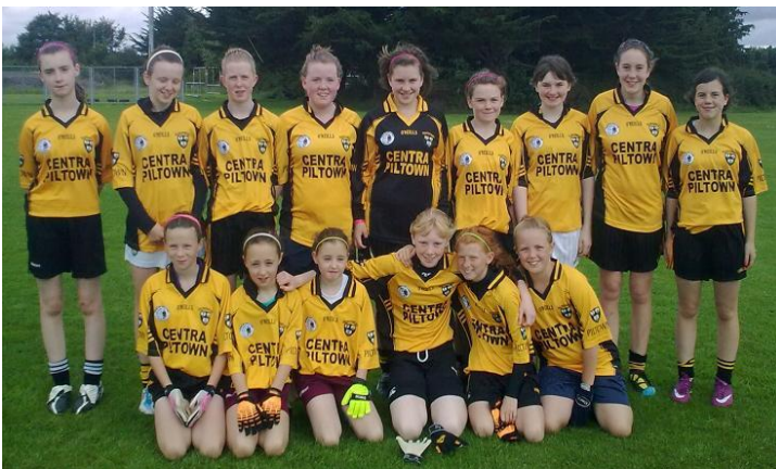
Freshford Under-14 Blitz