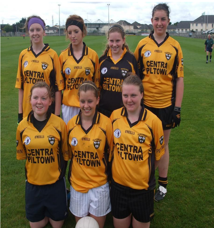
The Under-16 Squad who beat Mullinavat by 3-6 to 3-2 in the County 7-A-Side Shield Final at Johns Park to record the club's first ever county title.