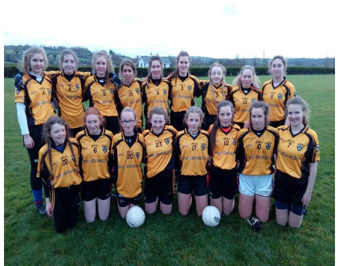
Under-16 Shield Finalists