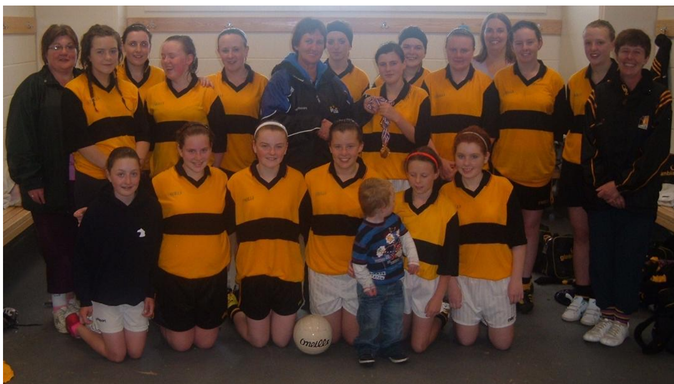
First Medals won by the Club!