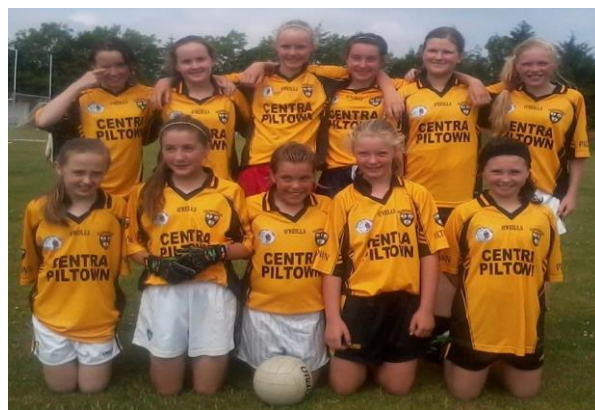
Above - Under-12s